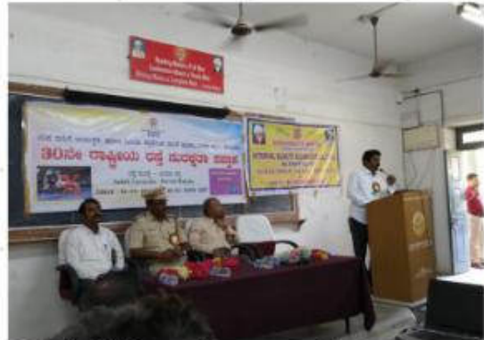
Road Safety Week Organized at our college in Association with R.T.O Kalaburagi