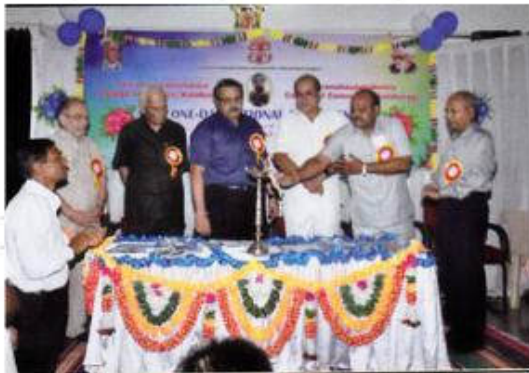
Inauguration of One Dy National Conference On NAAC 'A Road Ahead'