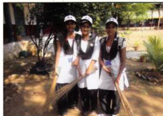
NSS Volunteers Cleaning the College Campus on Swachha Bharat Abhiyan