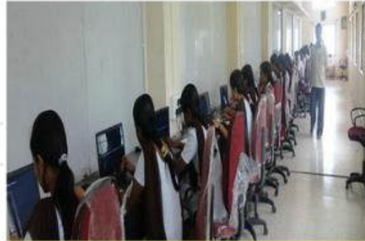
Students Practicing in Computer Lab