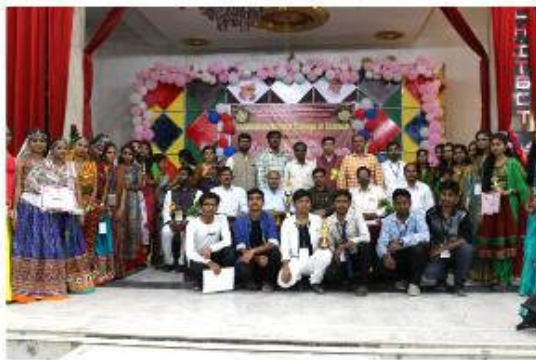
Principal, Staff, & Students Celebrating at the Valedictory & Prize Distribution of Ajiyankya Parva -2019