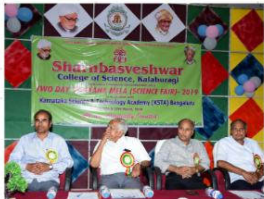
Inauguration Function of Vijnjana Mela in our college.