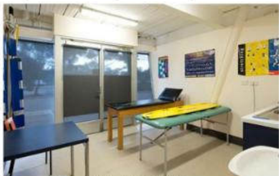
First Aid & Health Center