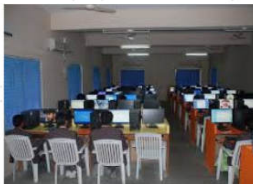
Students & Staff making use of Digital Library.

Our college library has a rich collection of books and journals with bar codes. The college has subscribed as member of information and Library Network(INFLIBNET) Center of UGC, Ahmadabad through which they can access to e-resources. The library is kept open from 8 am to 5 pm. News papers, magazines and periodicals are provided