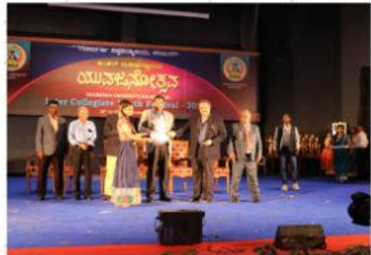
College Student Receiving Certificate at Inter college Youth festival Held at Gulbarga University, Kalaburagi