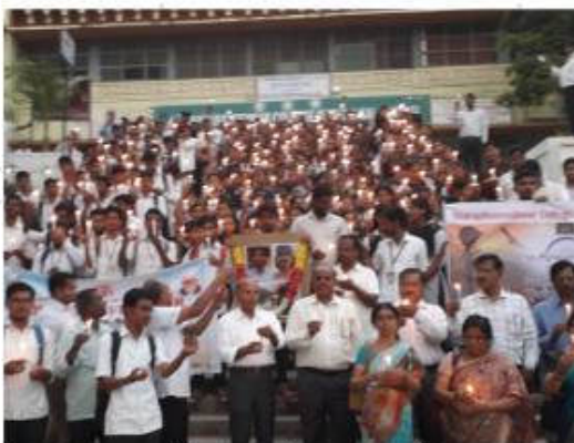
College Staff & Students March in respect to the martyrs of Army & to Create Social Awareness