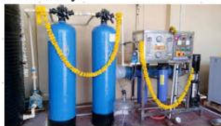
R.O Water Purification Plant