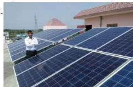
Solar Grid as part of Green Initiative