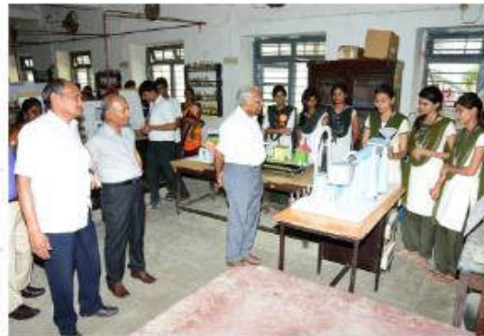
Students Explaining to Guest about their project during Vijnyana Mela