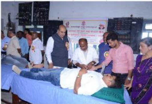
College Staff Donating Blood on Red Cross Foundation Day at our college.