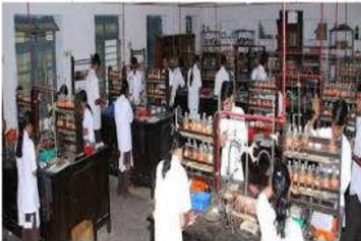
Students performing Experiments in Chemistry Lab