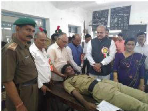
Blood Donation Camp by NCC Volunteers