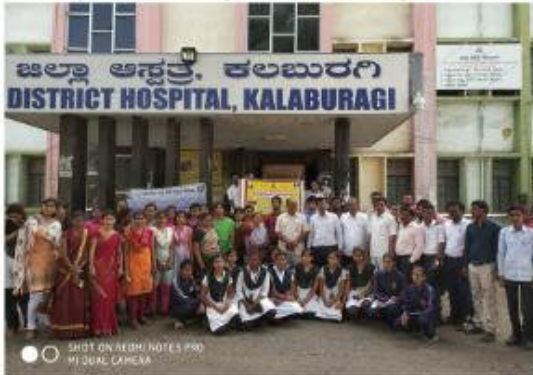
College Staff & Students doing Community Service at District Hospital.