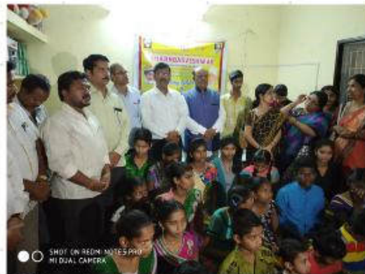
Visit to Orphanage Home under Extension Activities by College Staff