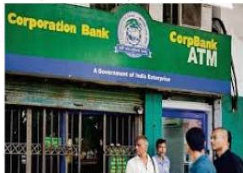
Bank @ College Campus