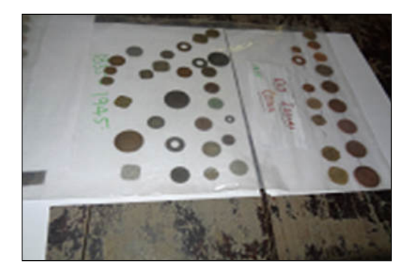
Coin collection by the students in Chaitanya Activities