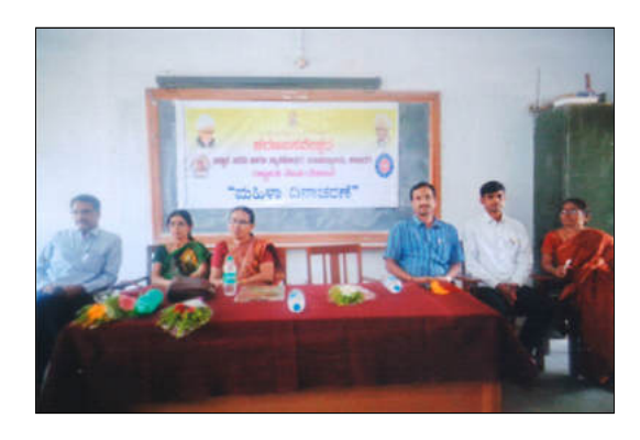
Celebration of Women's Day in the college - 2016-17