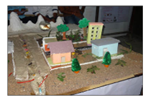
Project on Smart city exhibited by students in Chaitanya Activities