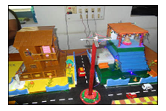
Project on Traffic light exhibited by students in Chaitanya Activities