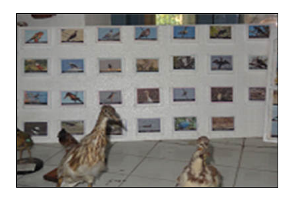
Diversity of birds exhibited by the students