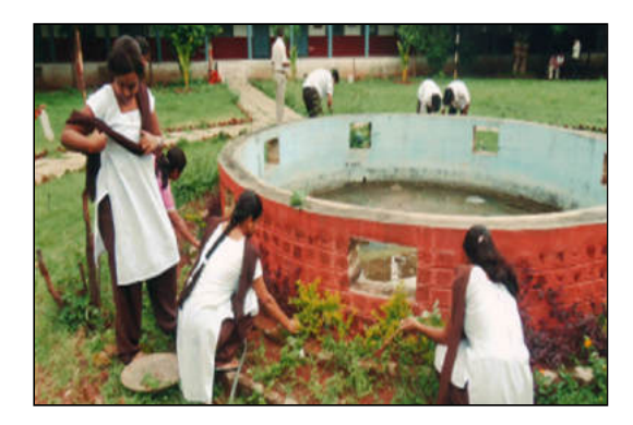
NSS volunteers in the college campus